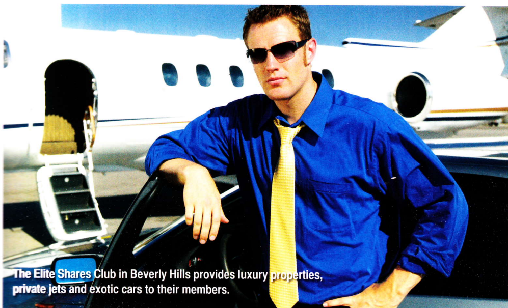
The Elite Shares Club in Beverly Hills provides luxury properties, private jets and exotic cars to their members.

You know you've arrived when you get that membership in the Elite Shares Club, a new luxury amenity club based in Beverly Hills. The club provides high net-worth individuals and corporate execs access to luxury properties in popular destinations such as Manhattan, Aspen, Vegas and Miami. Members also have unlimited access to private jet charters and exotic cars. The company's goal is to offer an all-in-one program that far outweighs more typical fractional ownership programs. www.elitesharesclub.com