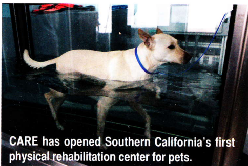
CARE has opened Southern California's first physical rehabilitation center for pets.

California Animal Rehabilitation (CARE) has opened Southern California's first physical rehabilitation center for pets. Rehabilitation is an emerging field in veterinary medicine; just as with humans, physical rehabilitation is especially helpful to pets with chronic and debilitating conditions like arthritis and dysplasia, or those recovering from surgery. CARE's 2600 square-foot facility in Santa Monica seems a lot like a human facility with an underwater treadmill, therapeutic laser, ultrasound, electrical stimulation devices, acupuncture, nutritional counseling, and so on. www.CalAnimalRehab.com